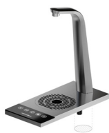
T3 MonoFit® font Circular cutout 60mm diameter.

Providing a simple solution for upgrading previous integrated tap installations, the T3 MonoFit® can be placed neatly over previously made cut-outs, allowing a quick and easy upgrade to any environment.