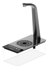
T3 regular font Rectangular cutout 146mm x 311mm.