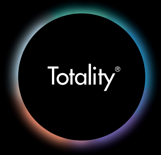
Hygiene assurance in every pour.